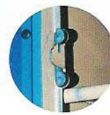
Old doors and hinges are scrapped.