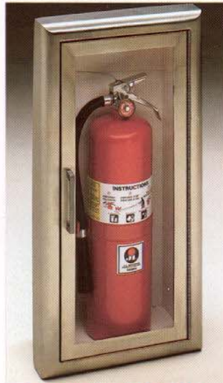
Cosmopolitan 1037F10FX with Fire FX™ Option

WHI Test Nos.: • 631-021201 • 631-021202