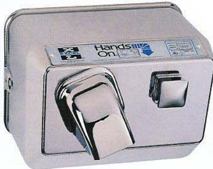
76-C, H76-C Surface Mounted chrome plated cover