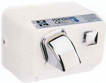
76-W, H76-W Surface Mounted white epoxy paint cover