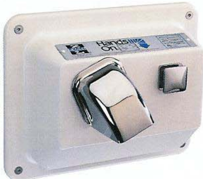
R76-W, RH76-W Recess Mounted white epoxy paint cover